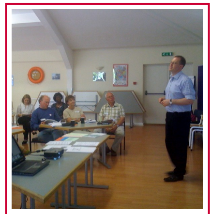
Supporting Groups Working with Children & Young People

RCVYS has brought over £33,000 worth of accredited youth work training to Reading, up-skilling 43 members or staff and volunteers, with 32 studying towards the new QCF Qualifications